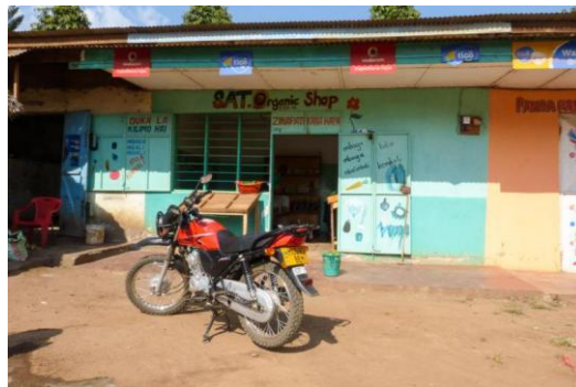
An organic seed shop in Morogoro, Tanzania. Shops like this one will soon be outlawed under the terms of a poverty-reduction initiative which critics say helps big agribusiness, and hurts farmers