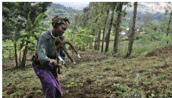
A woman works a field near the Tanzanian town of Arusha

Agribusiness companies are taking advantage of Tanzania's desperate need for aid to push a development plan that will allow them to dominate the country's agriculture sector and plunge farmers into debt. A similar plan led to a suicide epidemic among Indian farmers in recent years.