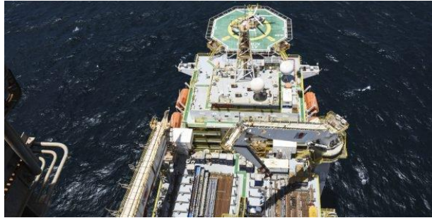
Le navire de forage Atwood Achiever, de la société Kosmos Energy, au large des côtes sénégalaises