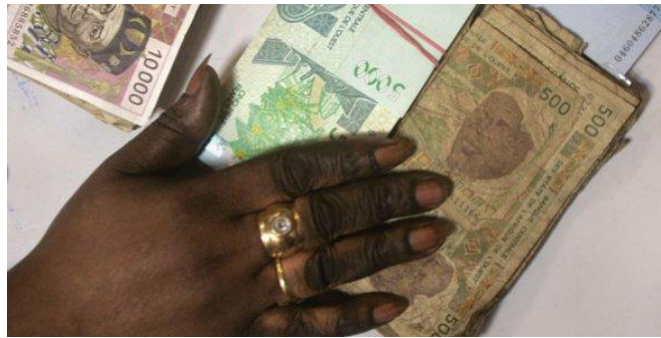
Un employé de banque comptant des francs CFA

La Banque centrale des États de l'Afrique centrale tord le cou à la rumeur qui court depuis une semaine selon laquelle elle imprimerait désormais sa propre monnaie.