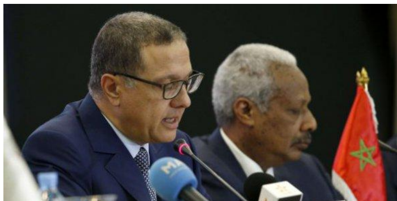
Mohamed Boussaid, le ministre marocain de l'Economie et des Finances

En établissant leur liste noire des paradis fiscaux, qui comprend 17 États ( dont la Tunisie ), les ministres des Finances de l'UE avaient d'abord considéré que les facilités fiscales que le Maroc accorde aux entreprises européennes installées sur son sol encourageaient d'éventuelles fraudes.