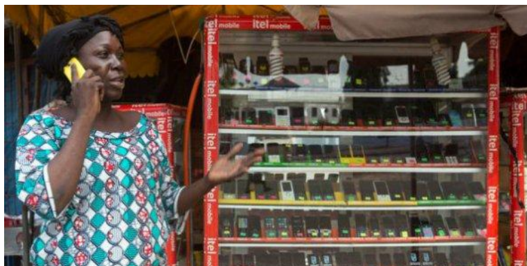
Une femme vend des téléphone portables à Cotonou, au Bénin

À l'heure des bilans, force est de constater que l'année qui s'achève n'a pas été de tout repos pour les télécoms. Alors que l'Afrique a dépassé le milliard d'abonnés mobiles, retour sur les amendes, les pertes ou octrois de licences et les bras de fer qui ont marqué l'année.