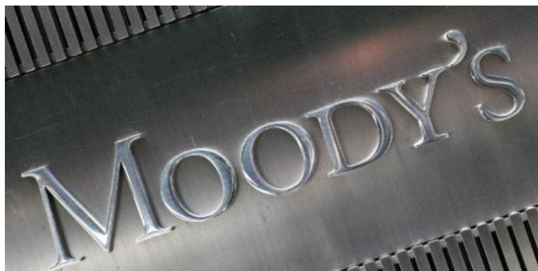
Logo de l'agence de notation financière Moody's, à New York