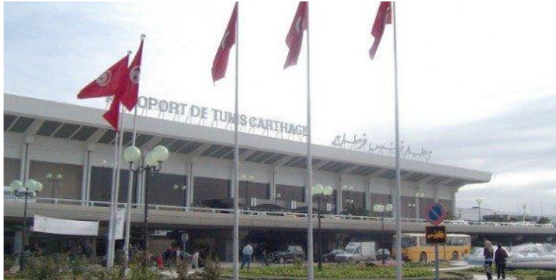
L'aéroport de Tunis-Carthage reste la chasse gardée de Tunisair pendant encore cinq ans

Sept ans après le début des négociations entre Tunis et Bruxelles, la convention sur l'Open Sky tunisien a été signée ce lundi, ouvrant la voie à une augmentation du trafic et de la concurrence dans le ciel tunisien. Seul l'aéroport international de Tunis-Carthage reste pendant cinq ans la chasse gardée de Tunisair, la compagnie nationale en grande difficulté.