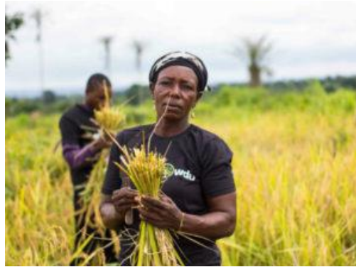
Nigerian startup Farmcrowdy closes on seed funding of $1 million.