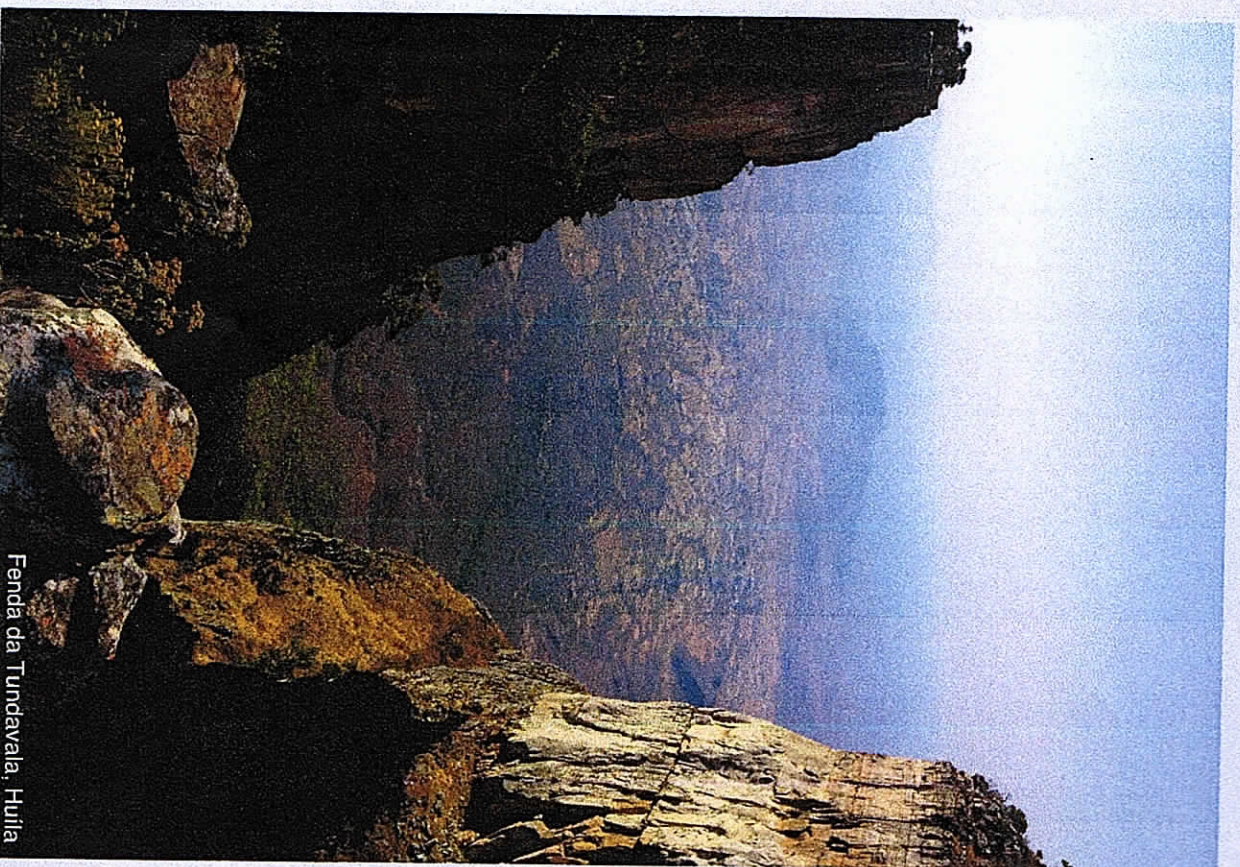
Fenda da Tundavala, Huila