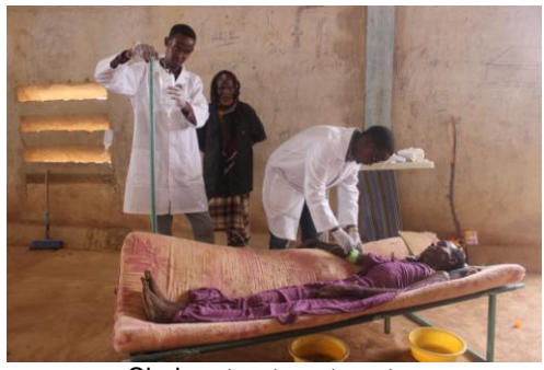
Cholera treatment centre