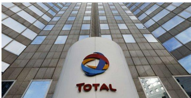
Vue du siège de Total à la Défense, en région parisienne

Ce champ pétrolier comprend 34 puits forés qui sont raccordés à une nouvelle plateforme à ancrs tendues, première du groupe en Afrique, et à une nouvelle unité flottante de production baptisée Likouf.