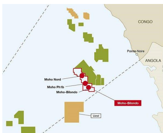
Vue des gisements du bloc Moho Bilondo, au large des frontières congolaises

Ce projet offshore , lancé par Total en 2013, vise à extraire le pétrole de gisements supplémentaires au sein du permis d'exploitation de Moho-Bilondo, où le groupe extrait déjà de l'or noir depuis 2008.