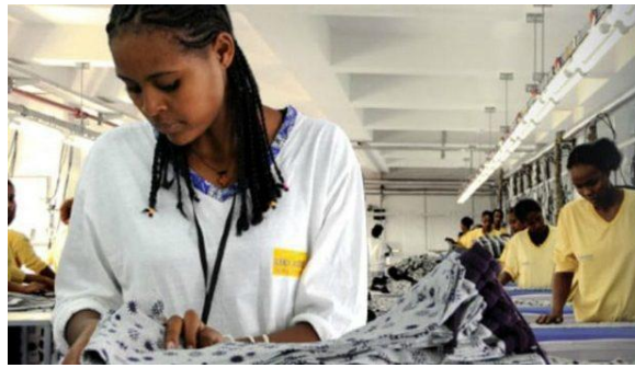
Ayka Textile, Ethiopia.

Investors include Chinese conglomerate Jiangsu Sunshine Group, which deals in wool textiles and garments. The company has decided to invest close to US$1 billion in Ethiopia.