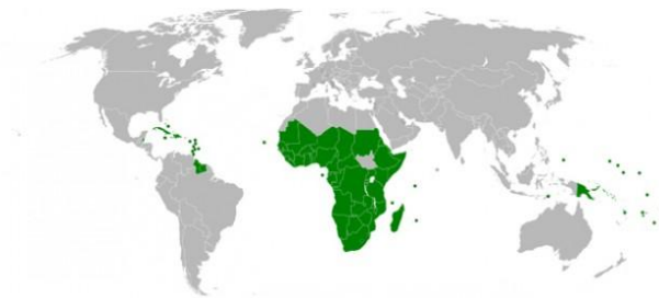
Map of the African, Caribbean and Pacific Group of States (ACP) member states

Seventy-nine countries from Africa, the Caribbean and the Pacific, which are home to around one billion people, will speak with one voice as they prepare to negotiate a major partnership agreement with the European Union (500 million inhabitants) in May.