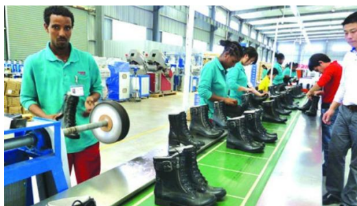
China's Huajian shoe factory in Addis Ababa

Manufacturing is a hot topic in the global economic environment. Americans want to see locally made products. Same in the U.K. and other parts of Europe. The labor force in these markets are focused on creating jobs.