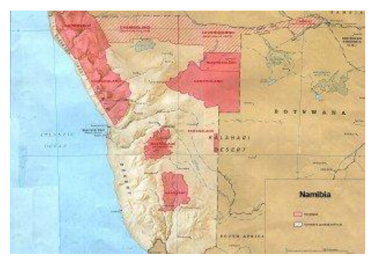
A map of Namibia and its offshore and homeland territories

Namibia is looking to make progress on its flagship Kudu gas project this year, encouraging the many smaller upstream investors who continue to believe in the southwest African country's offshore potential