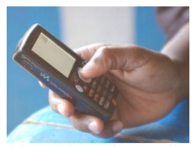
Terrapay has launched a international money transfer services to mobile wallets in Tanzania

Terrapay, an international payment company has launched an international money transfer service in Tanzania. The company received approval from the Bank of Tanzania (BoT) to send cross-border remittances to mobile wallets in Tanzania.